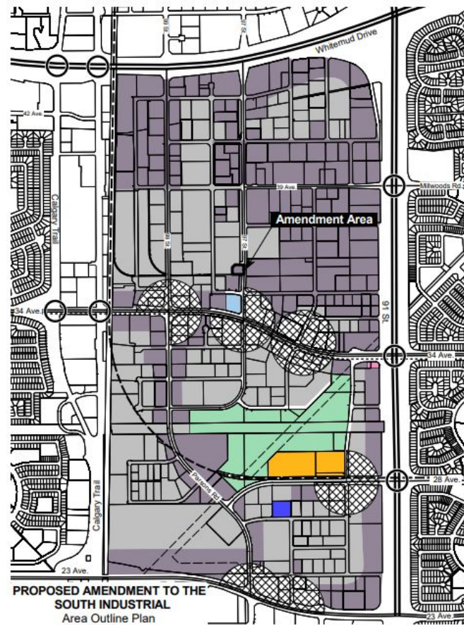
PROPOSED AMENDMENT TO THE SOUTH INDUSTRIAL Area Outline Plan (as amended)