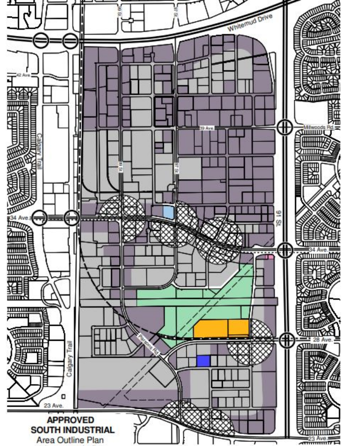
APPROVED SOUTH INDUSTRIAL Area Outline Plan (as amended)