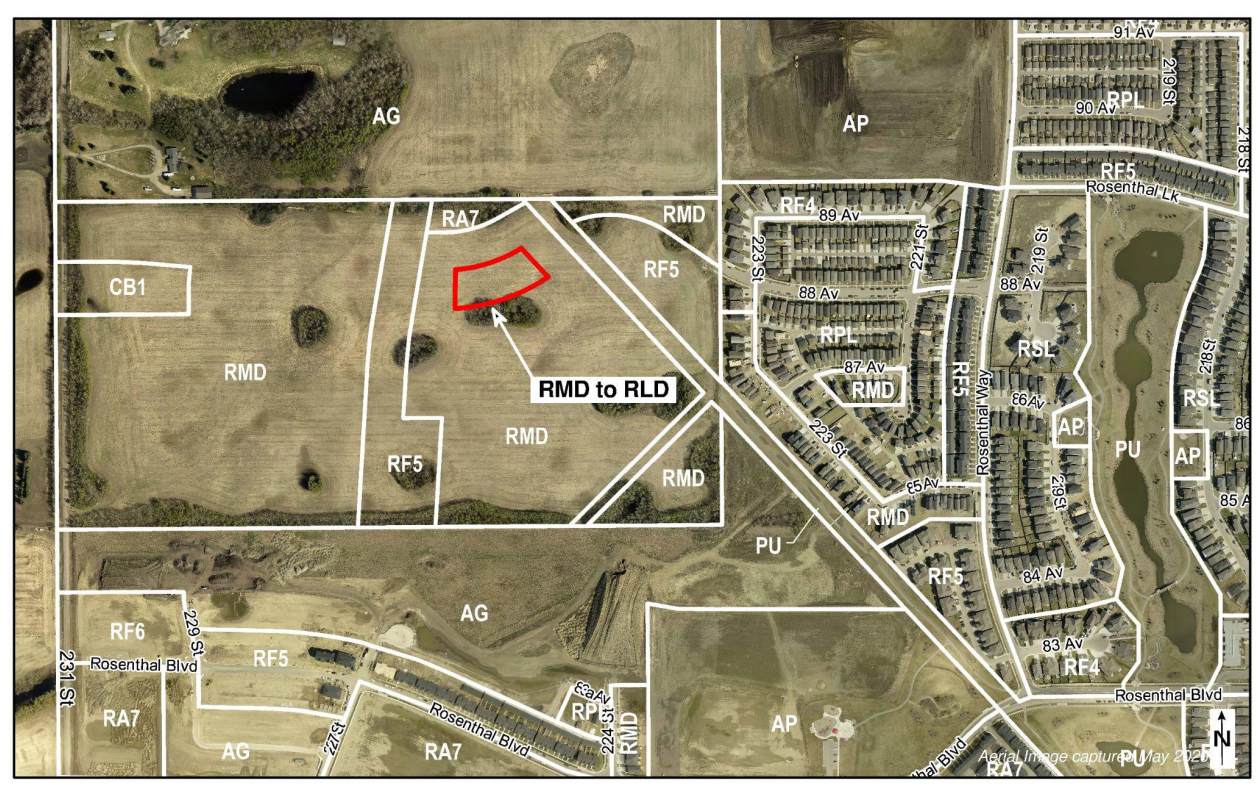
AERIAL VIEW OF APPLICATION AREA

The site is located north of Whitemud Drive NW and east of 231 Street NW and is undeveloped.