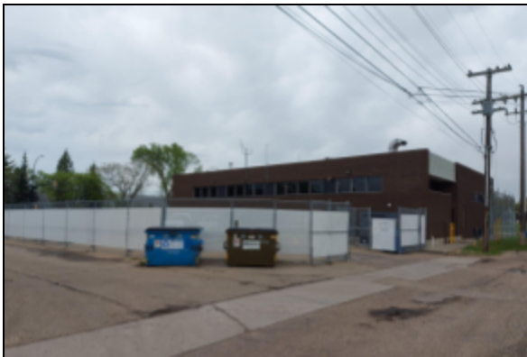
VIEW OF THE SITE LOOKING SOUTHWEST FROM REAR LANE