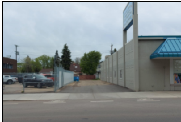
VIEW OF THE ROAD CLOSURE AREA LOOKING NORTH FROM 76 AVENUE NW