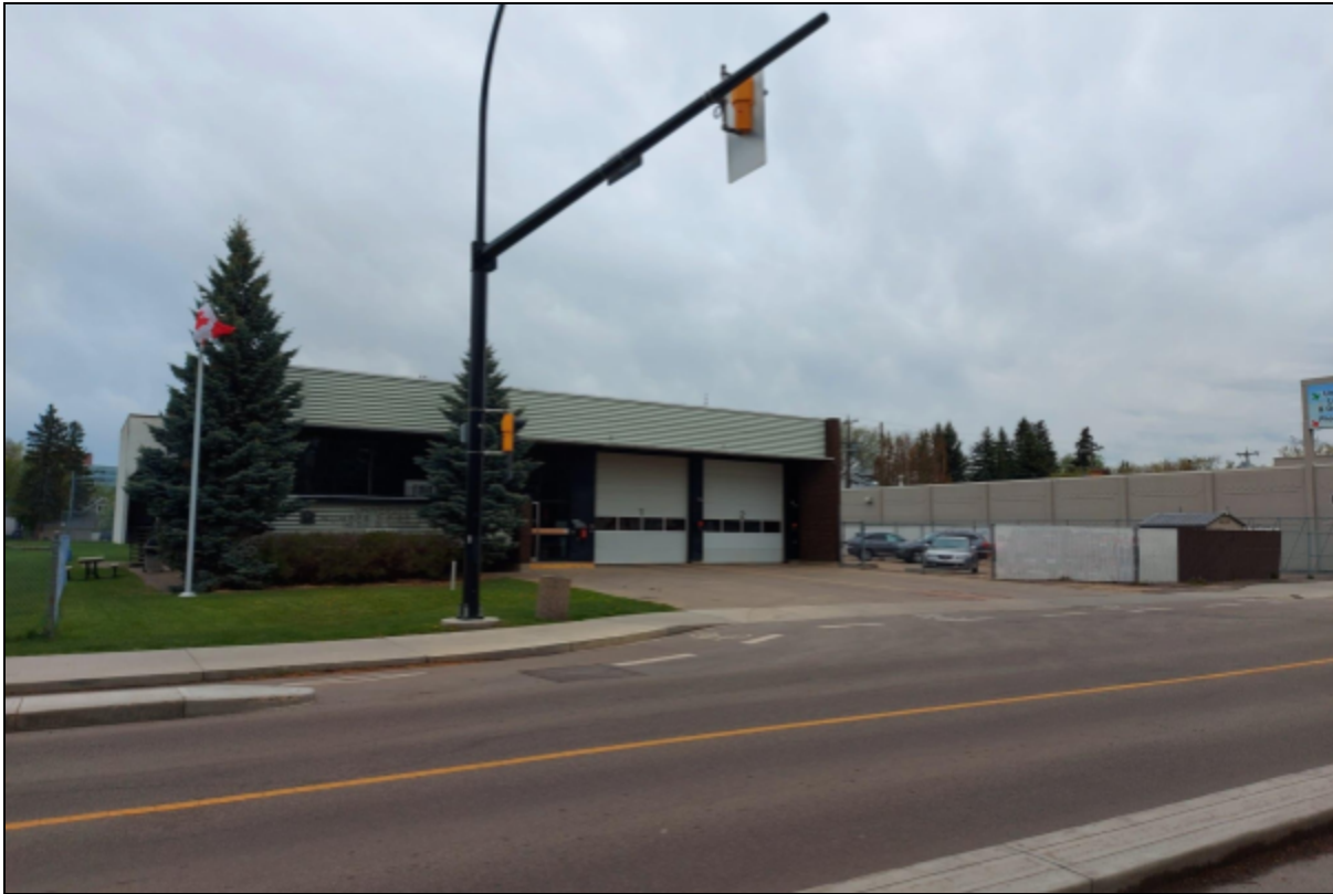
VIEW OF THE SITE LOOKING NORTHEAST FROM 76 AVENUE NW