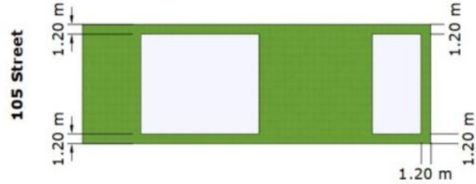
POTENTIAL RF4 BUILT FORM W/GARDEN SUITE SUITE