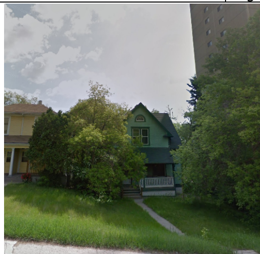
Photo of site from 103 Street NW