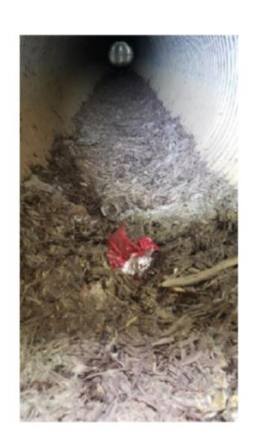
Debris found in Stormwater pipes.