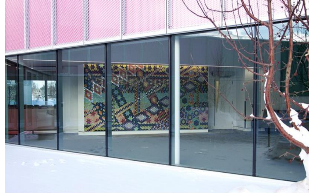
Created following a series of workshops with more than 200 residents of the Calder Community, this shimmering mosaic by Spacemakeplace interweaves stories, facts, histories, cultural patterns, and colour to create a true community-based artwork.