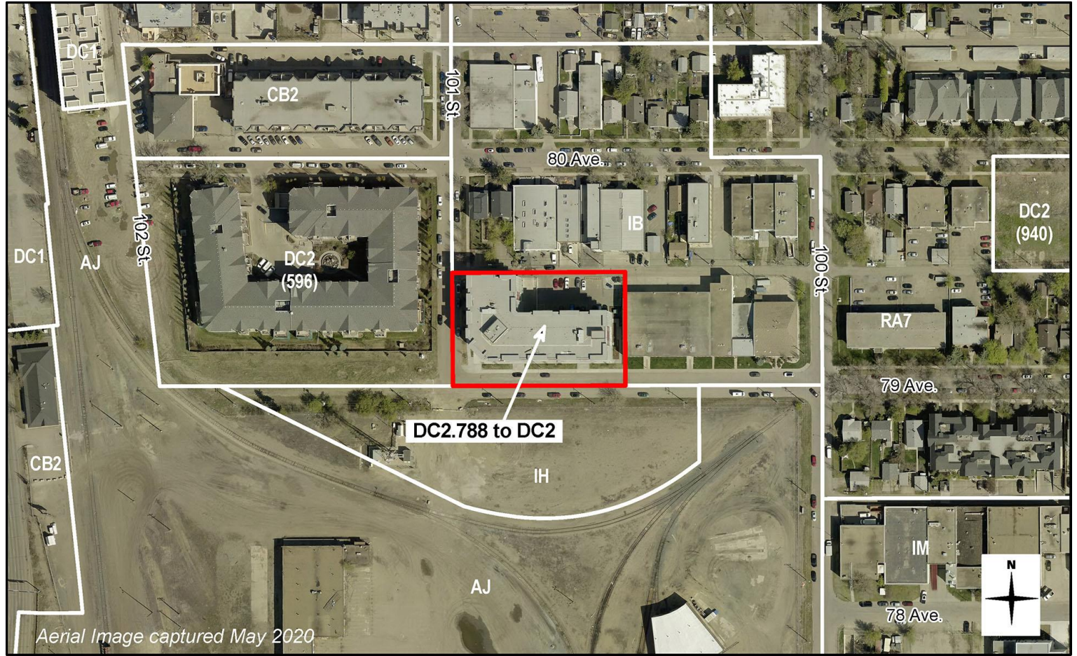
Aerial Image captured May 2020