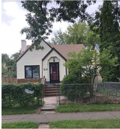
FACING WEST FROM 94 STREET NW