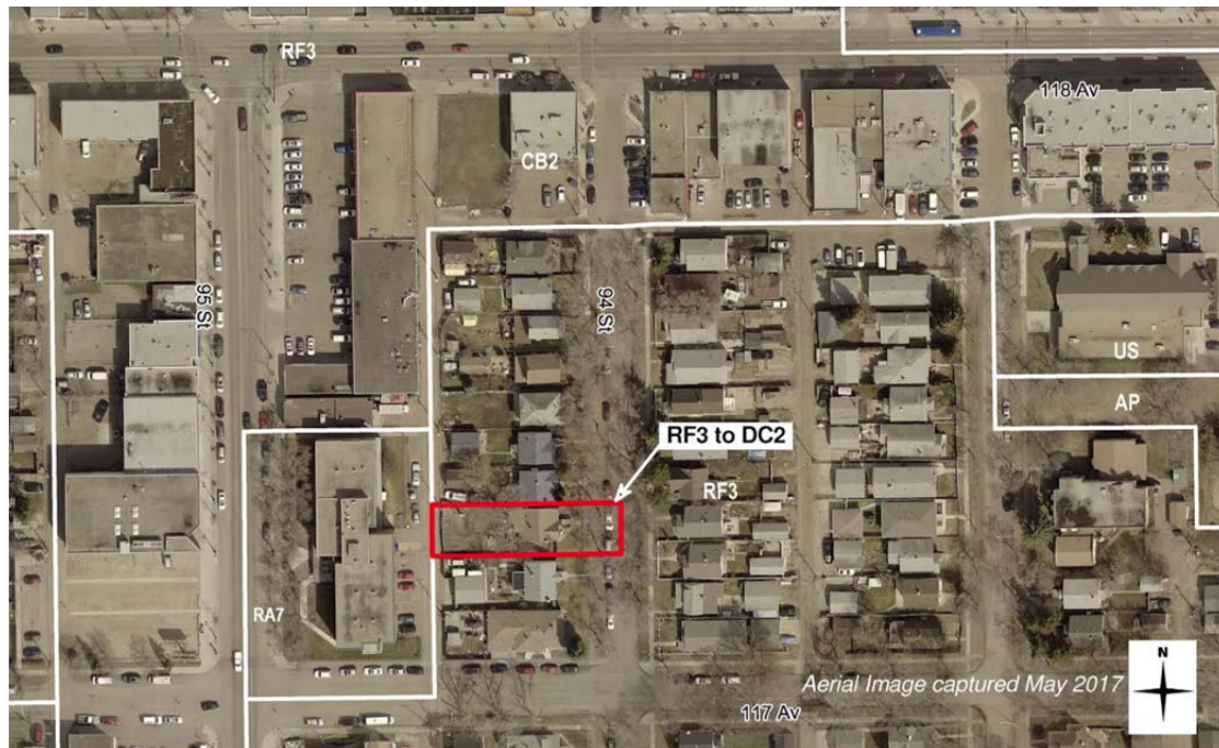
AERIAL VIEW OF APPLICATION AREA