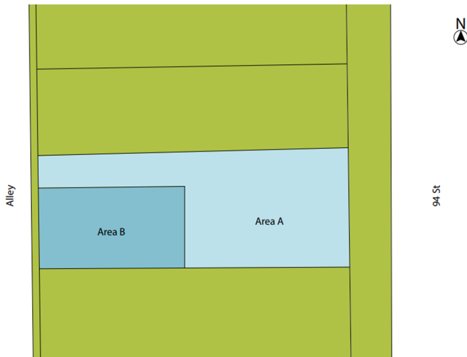
FUTURE CONFIGURATION OF LAND SHOWING AREA B SEPARATED FROM AREA A

The innovative opportunity created through the DC2 zone is in allowing the ability to subdivide Area B away from Area A, giving both Areas separate site dimension regulations. The regulations also require that Area A retain an adequate strip to the alley to accommodate independent vehicular access and servicing by underground utilities. If subdivided, this would result in separate ownership of each Area, as generally shown on the figure below.