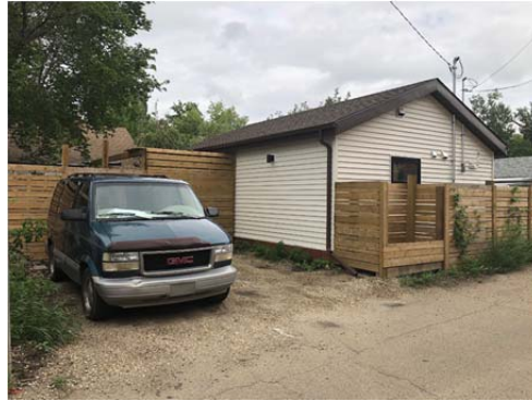
FACING SOUTHEAST FROM THE LANE