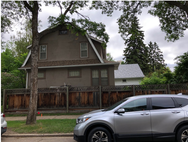
VIEW OF THE SITE FROM WEST