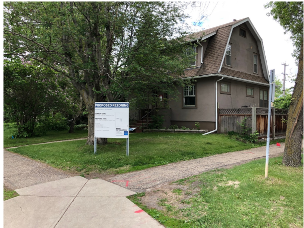
VIEW OF THE SITE FROM NORTHWEST