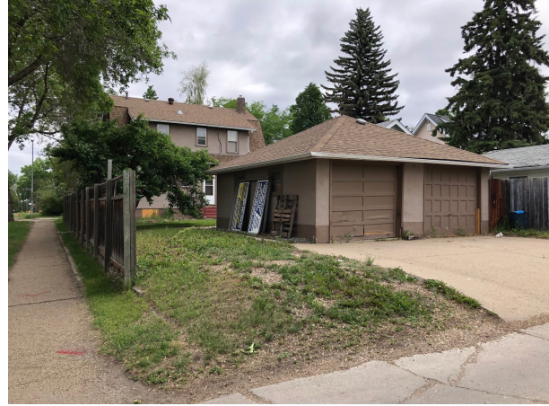
VIEW OF THE SITE FROM SOUTHWEST