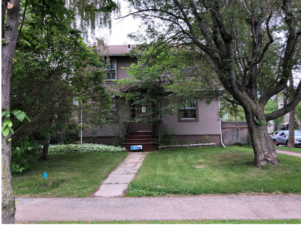
VIEW OF THE SITE FROM NORTH