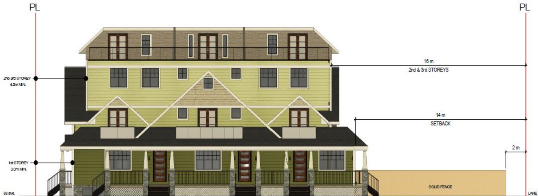
APPENDIX 2d WEST ELEVATION