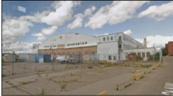
STREET VIEW FROM 109 ST. LOOKING NORTHEAST