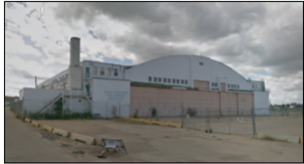
STREET VIEW FROM 109 ST. LOOKING SOUTHEAST