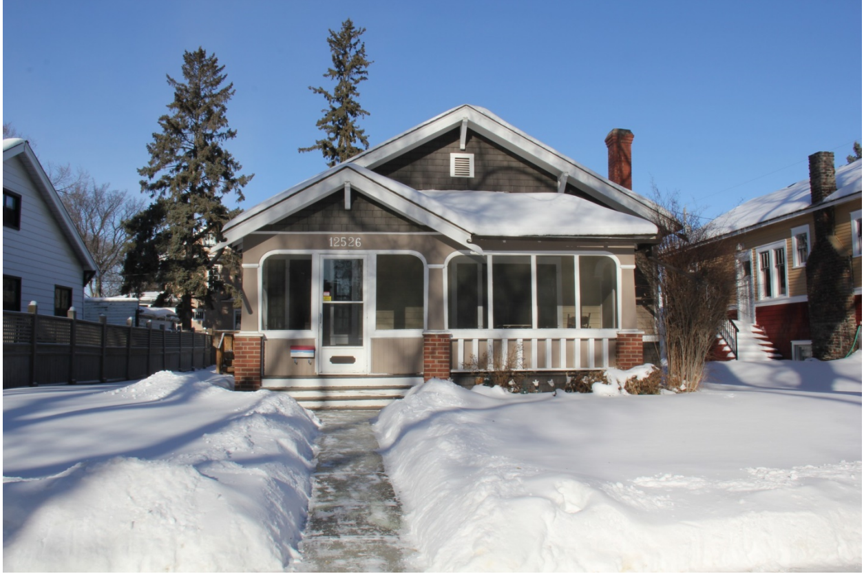
Photo #1 – South (front) elevation, viewed from 109A Avenue NW (2018)