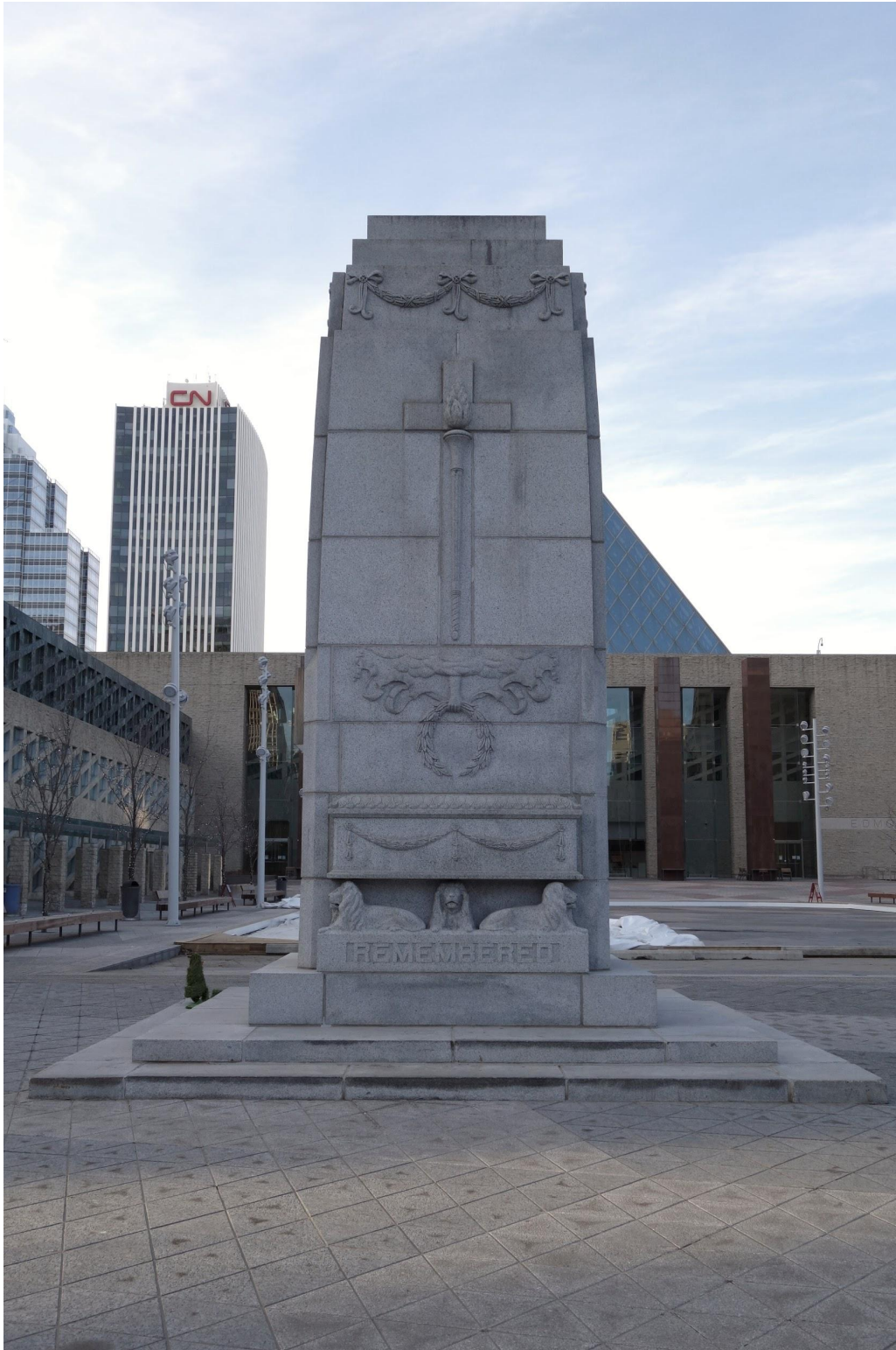
Edmonton Cenotaph South Elevation