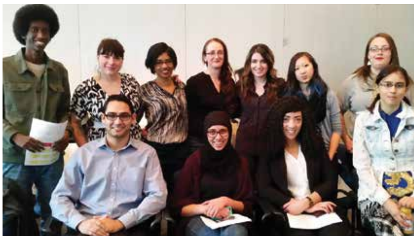
John Humphrey Centre for Peace and Human Rights, Youth Action Project on Poverty