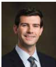
Mayor Don Iveson City of Edmonton EndPovertyEdmonton Task Force Co-Chair

Join the movement to end poverty in one generation.