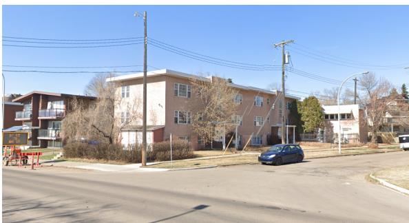
LOOKING NORTHWEST FROM JASPER AVENUE NW