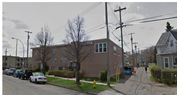
LOOKING SOUTHWEST FROM 91 STREET NW