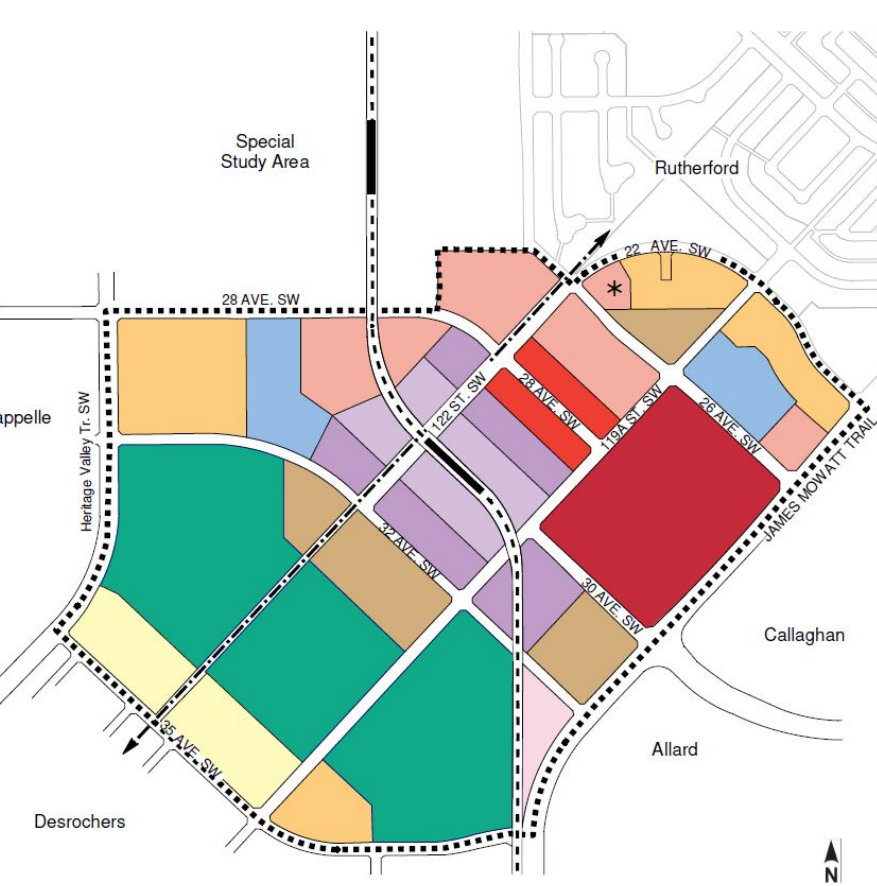
BYLAW 19852 HERITAGE VALLEY TOWN CENTRE Neighbourhood Area Structure Plan (as amended)