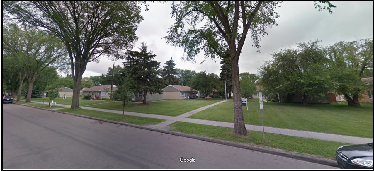
View of site from 95 Avenue looking northwest