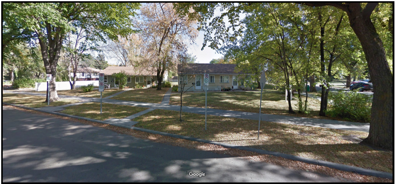
View of site from 81 Avenue looking east