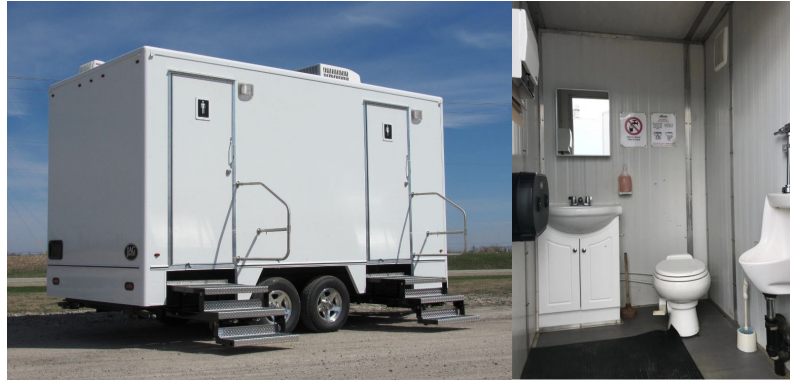
Temporary Washroom Facility