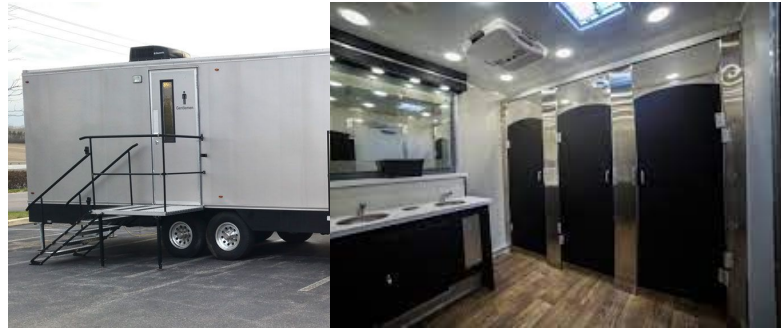
Enhanced Temporary Washroom Facility