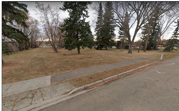
LOOKING SOUTHWEST FROM 60 AVE