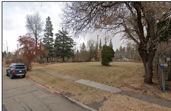
LOOKING NORTHWEST FROM 60 AVE