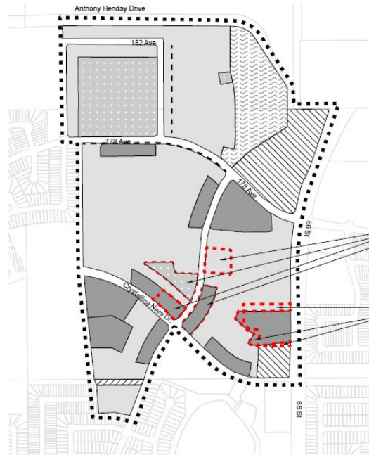
BYLAW 19923 AMENDMENT TO CRYSTALLINA NERA EAST Neighbourhood Structure Plan (as amended)