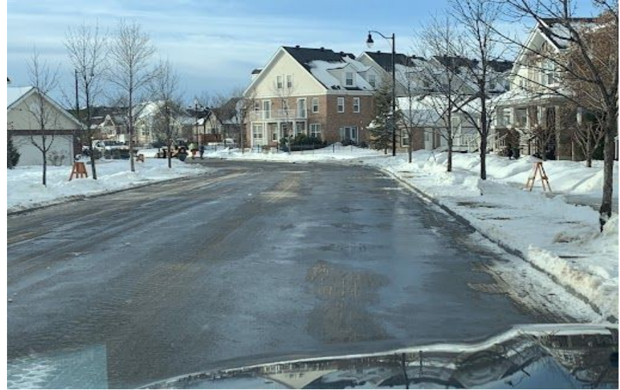
Griesbach, windrow removal trial, Jan 2022