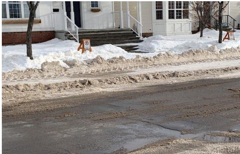
Griesbach, windrow removal trial, Jan 2022