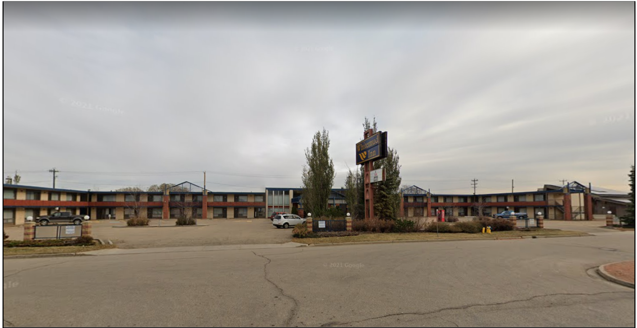
VIEW OF THE SITE LOOKING WEST FROM GATEWAY BOULEVARD NW