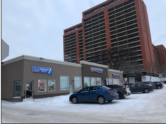
VIEW LOOKING NORTH FROM SIDE LANE