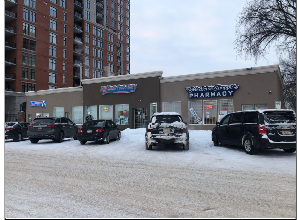
VIEW LOOKING WEST FROM JASPER AVENUE NW