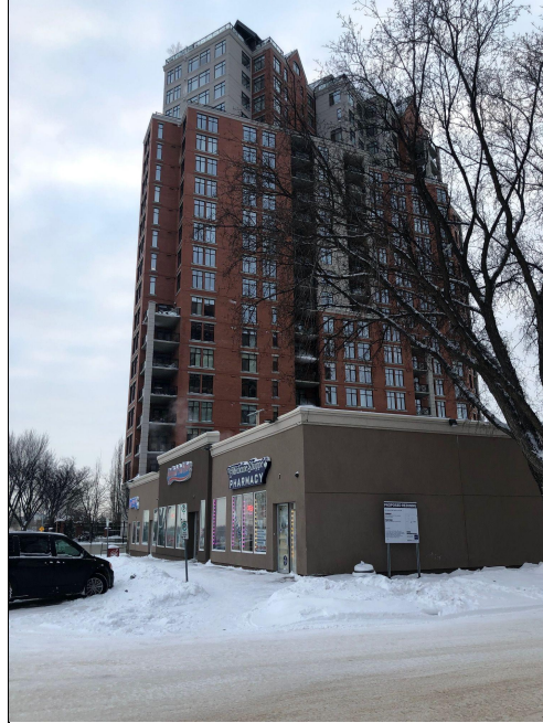
VIEW SHOWING THE NEW RESIDENTIAL TOWER BEHIND THE REZONING SITE

Administration believes that the CB1 Zone at this site generally meets the intent and objectives of this sub area and the plan. There are no adjacent low density residential buildings and there has been an increase in higher density residential development in the immediate and broader vicinity since the plan was written. It is therefore considered appropriate for the intensity of supporting commercial development to also increase in response.