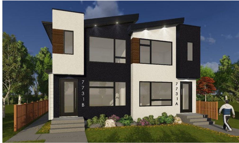
King Edward Park