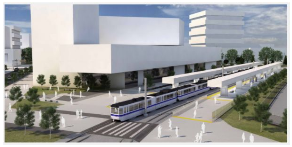
NAIT Station (Permanent)

with ground level retail and entertainment uses, combined with upper levels of offices and residential space. The station will also serve the surrounding mature neighbourhoods of Spruce Avenue and Westwood, along with Kingsway Mall.