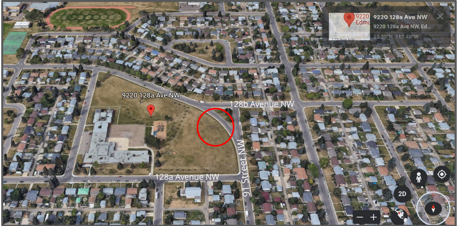
View looking north from 91 Street NW