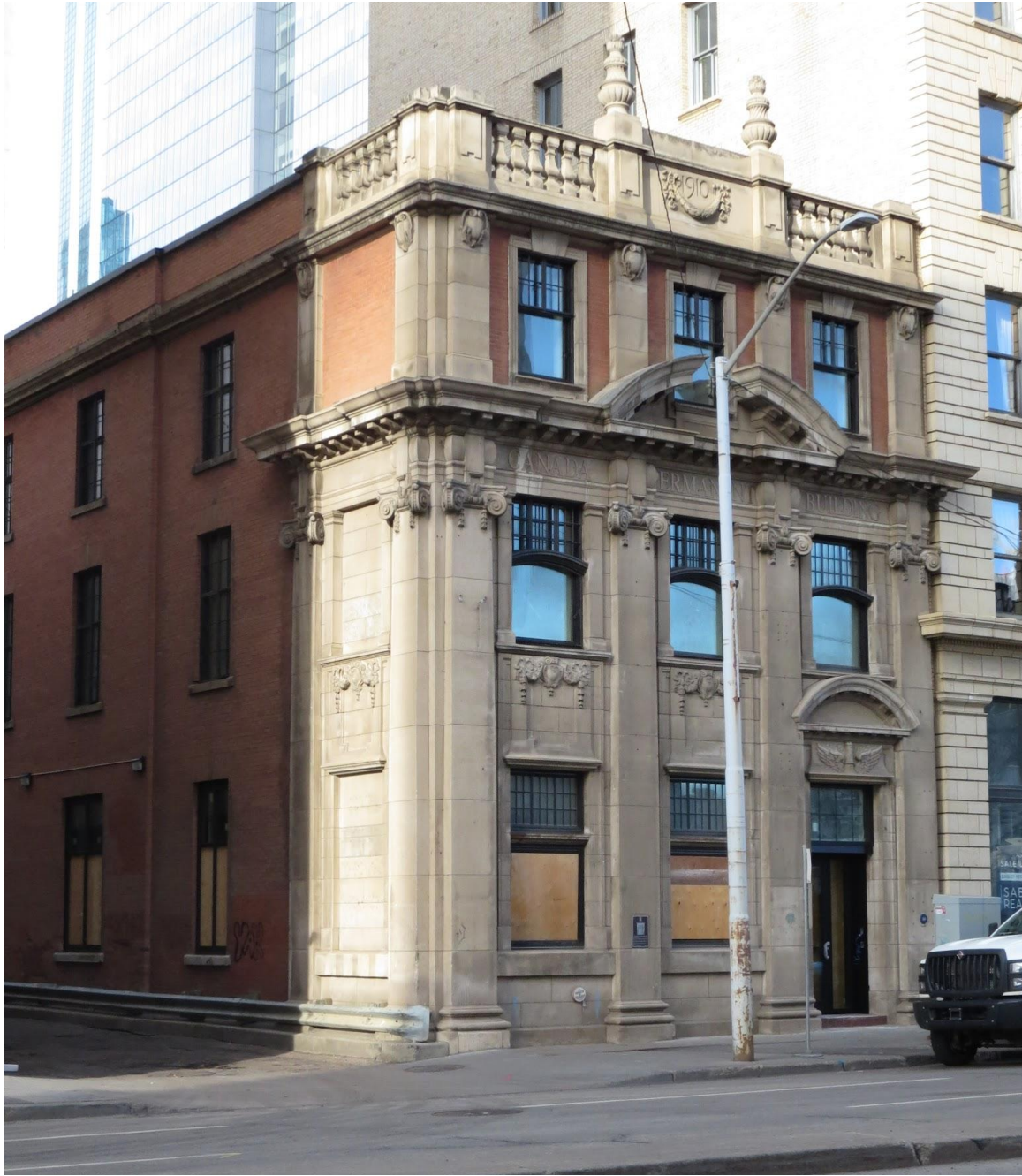
East and South Facades, 2021