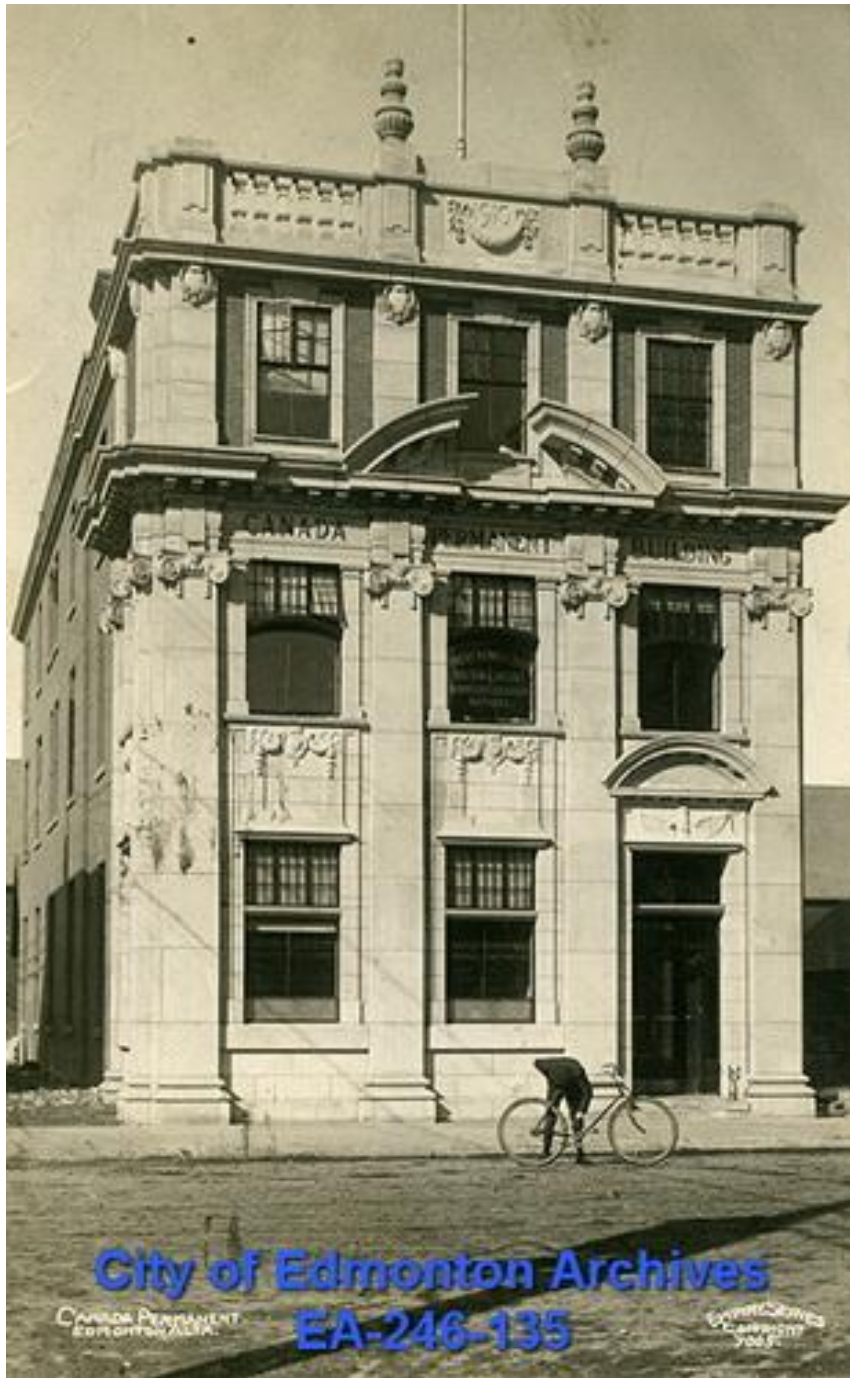
East Facade, Circa 1911