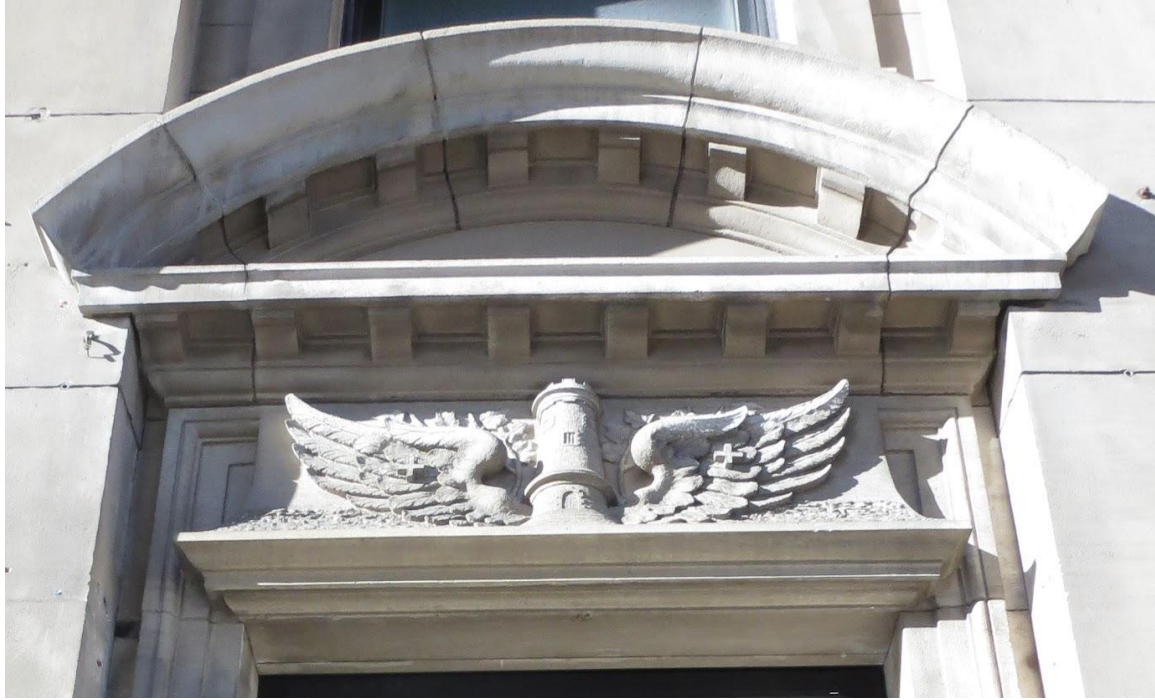
Bas Relief “Winged Lighthouse” and Arched Pediment Above Main Entrance