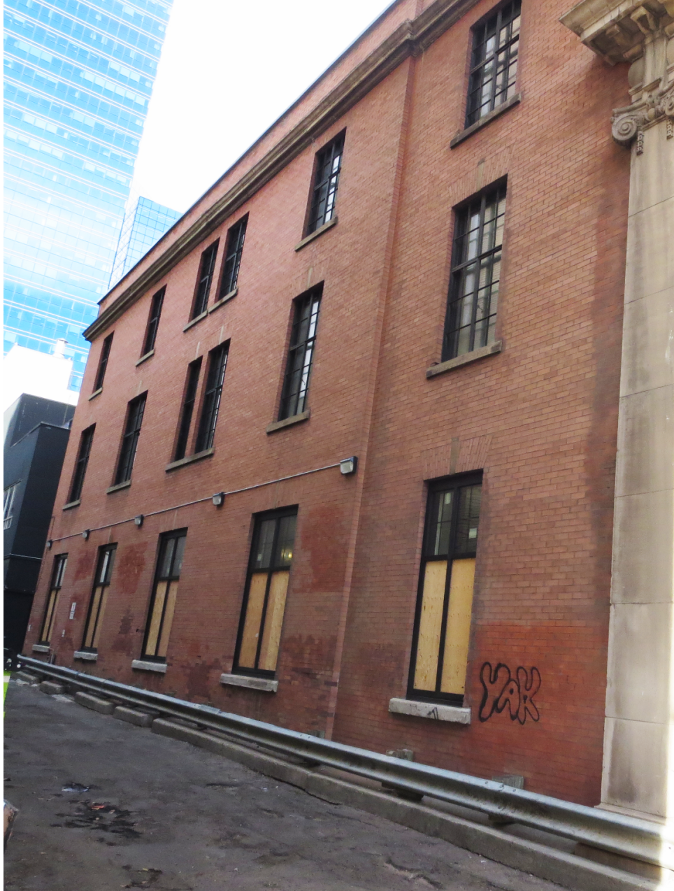
South Facade, 2021