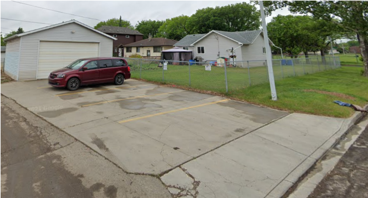
View of the site looking southwest from rear lane (Google Street View June 2021)