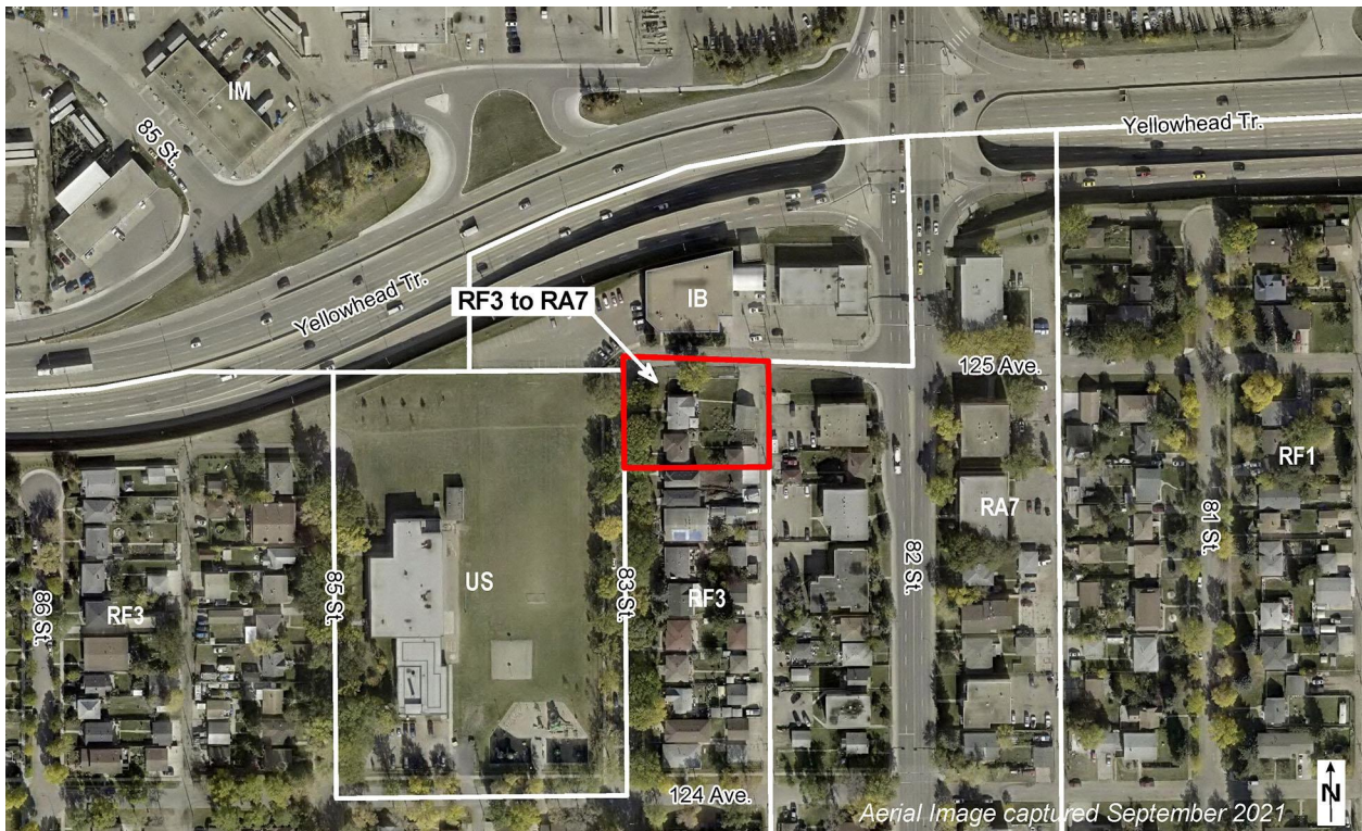
Aerial view of application area

The property abuts a variety of different uses. To the east, across 82 Street NW, is St. Gerard Catholic elementary school with its large field and playground. To the north are two parcels zoned for Industrial Business and to the east are several RA7 Zoned properties occupied by a mix of low-rise apartments and single detached homes. The largest impact will be experienced by the property immediately to the south, which has recently been redeveloped with a new single family home. The combination of abutting uses, and location on the north end of the block, will combine to limit the impact this development would have on surrounding lands and the community.