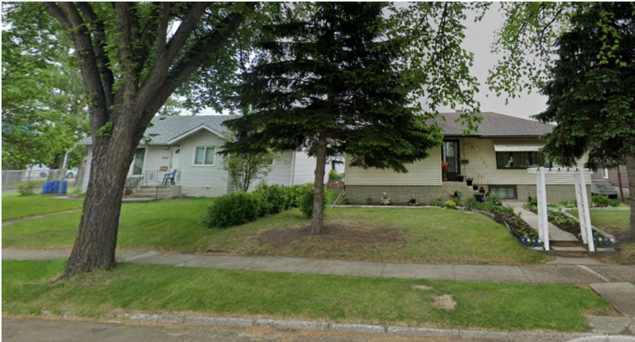
View of the site looking east from 83 Street NW (Google Street View June 2021)