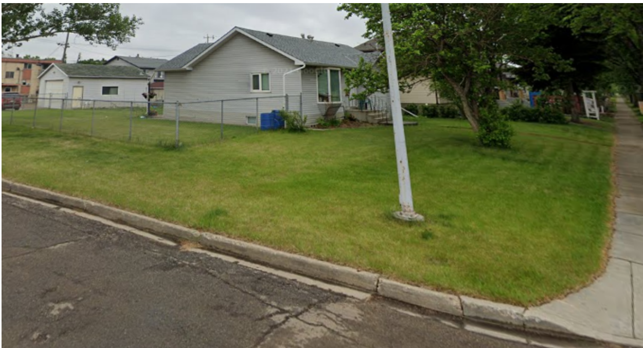
View of the site looking southeast from 125 Avenue NW