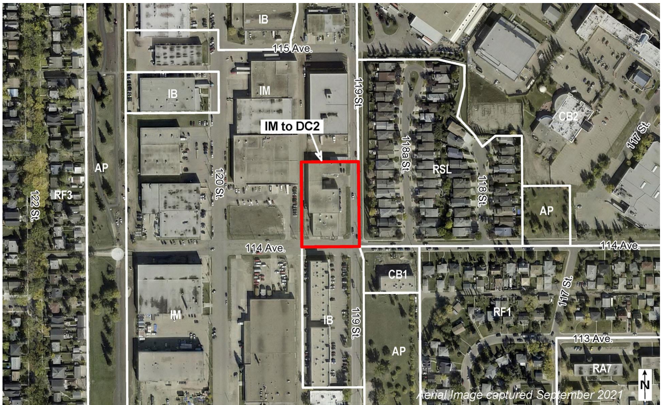
Aerial view of application area