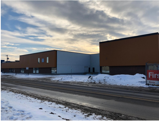
View of the site looking southwest from 119 Street NW