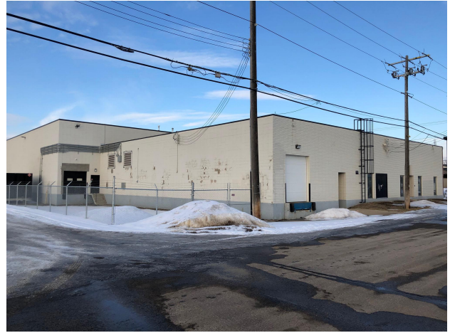
View of the site looking northeast from 114 Avenue NW