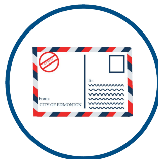
PUBLIC HEARING NOTICE SITE SIGNAGE Feb 28, 2022