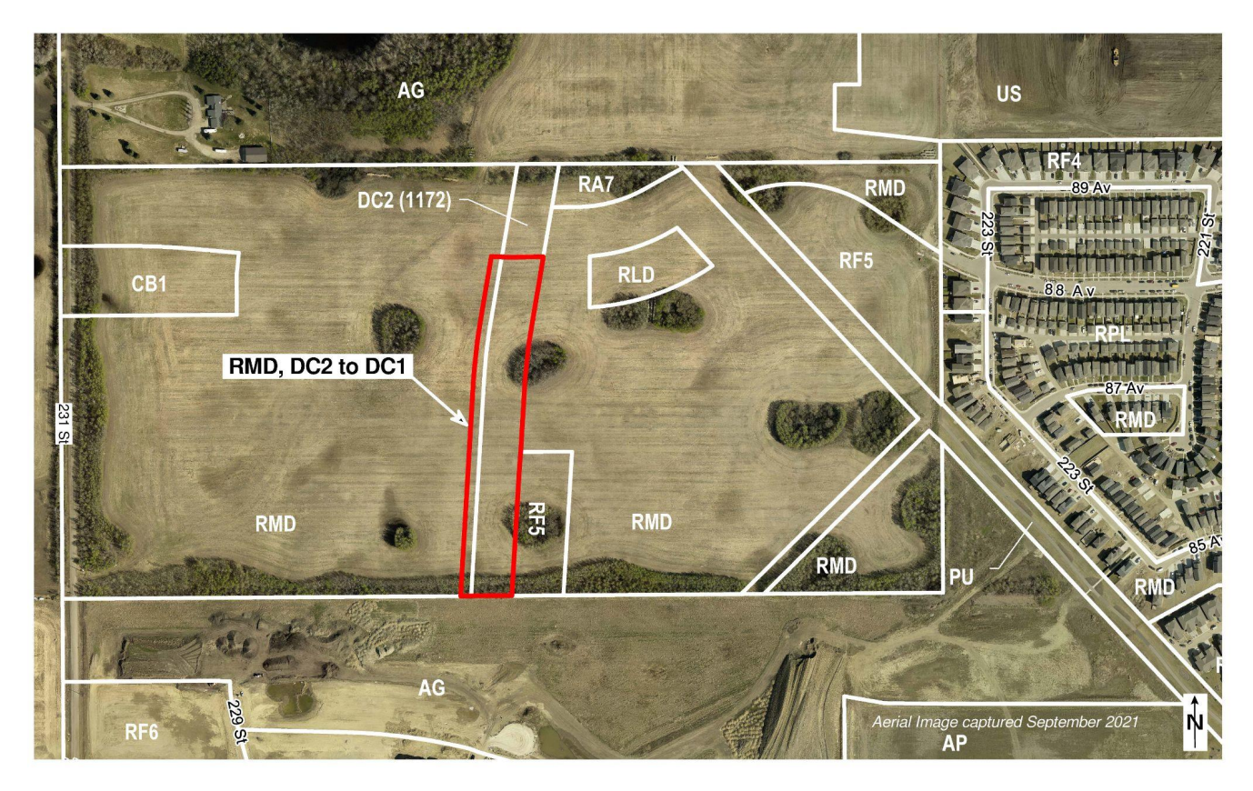
Aerial view of application area

The site is located north of Rosenthal Boulevard NW and east of 231 Street NW and is undeveloped.