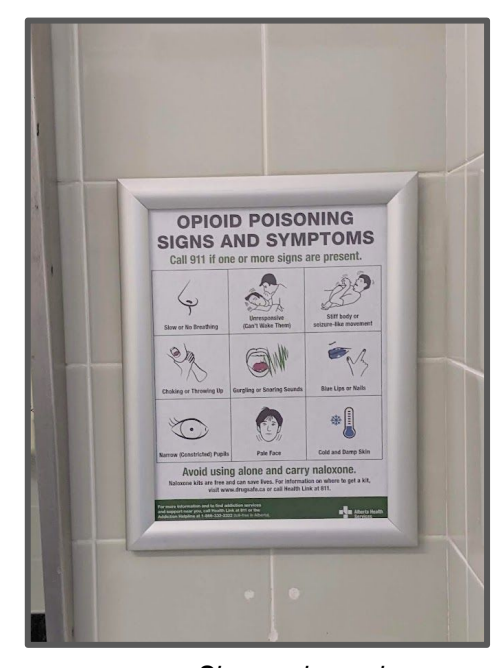
Signage in washrooms