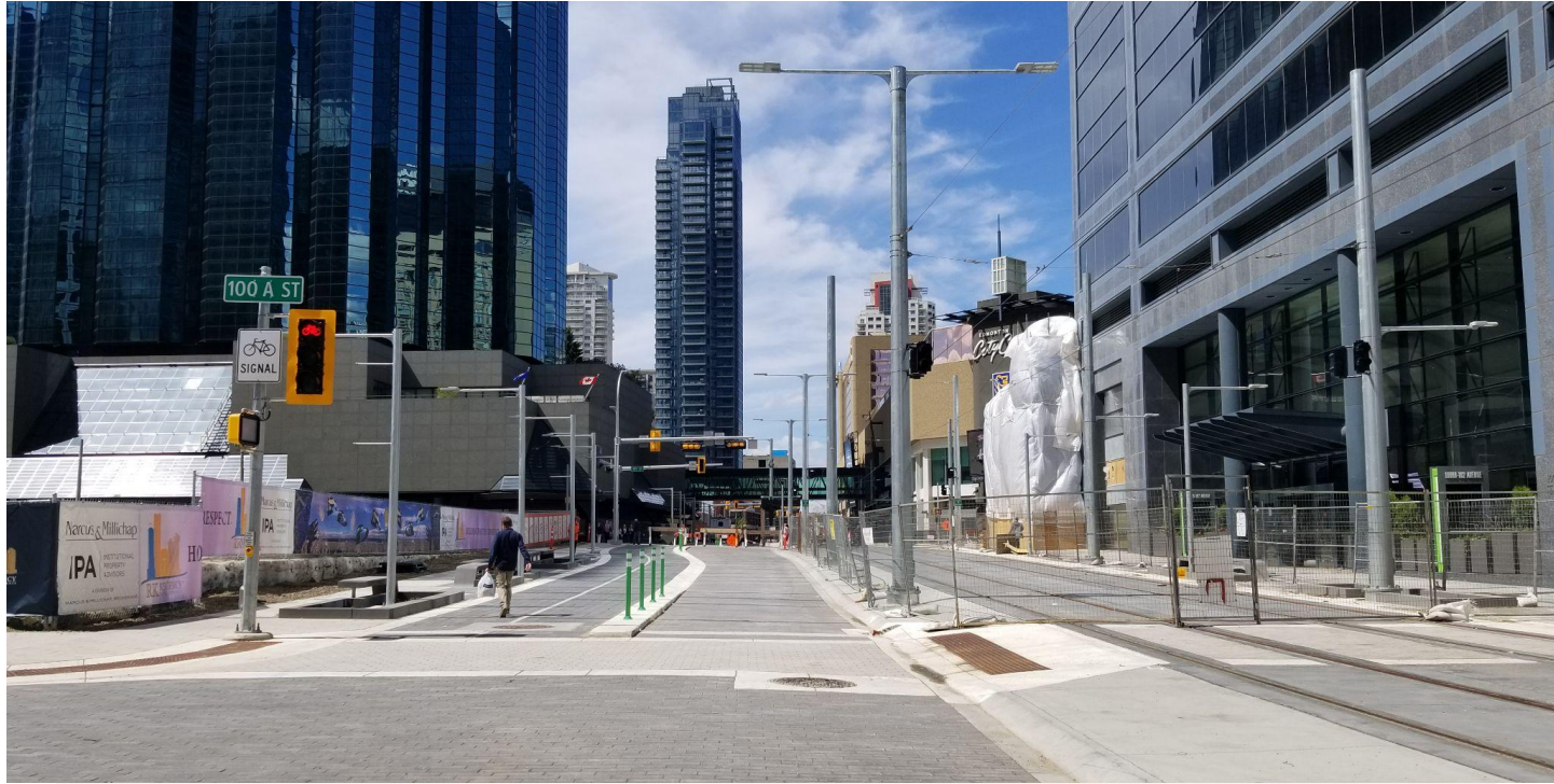
102 Avenue (between 100A and 101 Street), Looking West