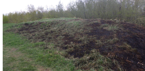
May 16, 2022