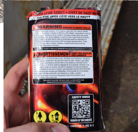
April 14, 2022