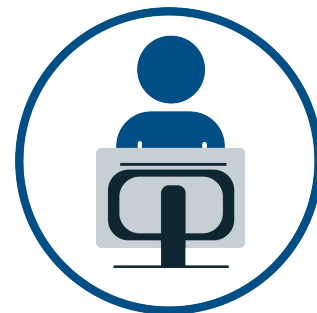
CITY WEBPAGE Jan 24, 2022