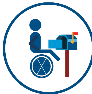
ADVANCED NOTICE Jan 17, 2022