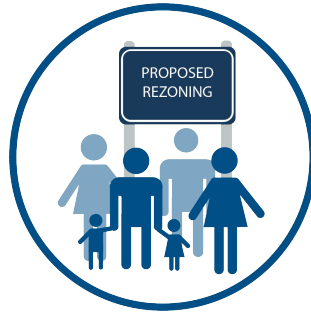
SITE SIGNAGE November 25, 2021