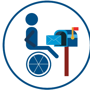
ADVANCE NOTICE November 17, 2021