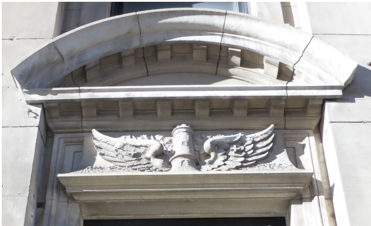
Bas relief "winged lighthouse" and arched pediment above main entrance