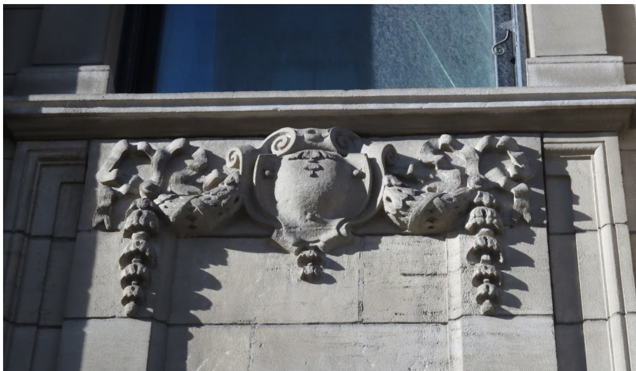
Bas relief garland and shield below second floor window