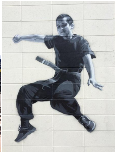
Chiu Lau Building 153 Street and Stony Plain Road