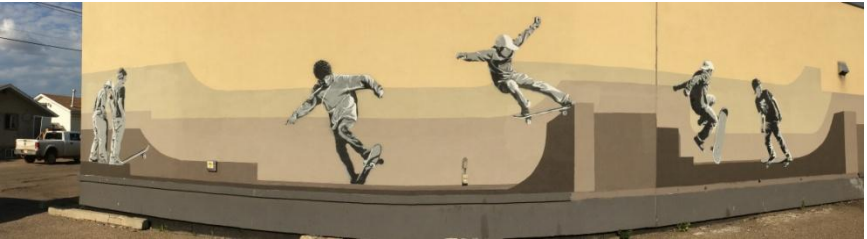
7-11 163 Street and Stony Plain Road