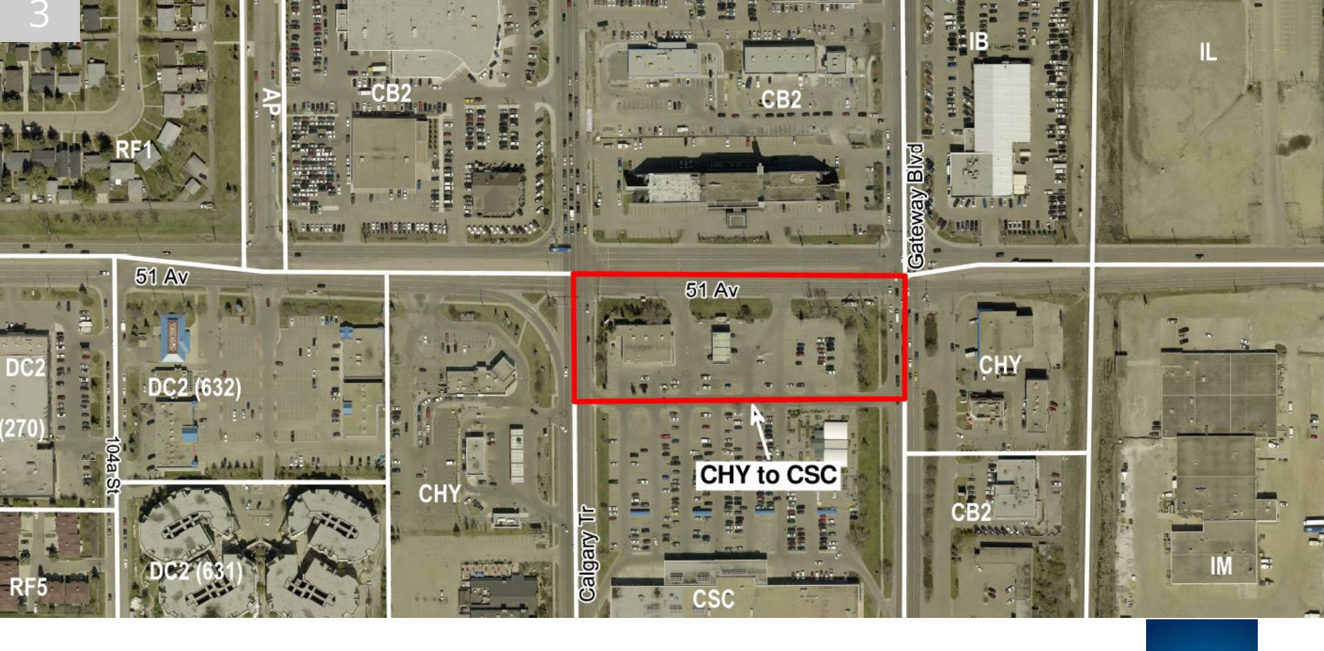
ADMINISTRATION'S RECOMMENDATION: APPROVAL