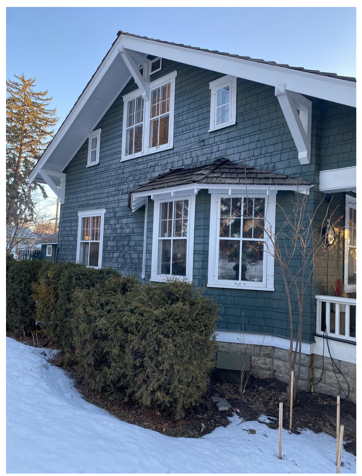
West elevation, looking northeast.