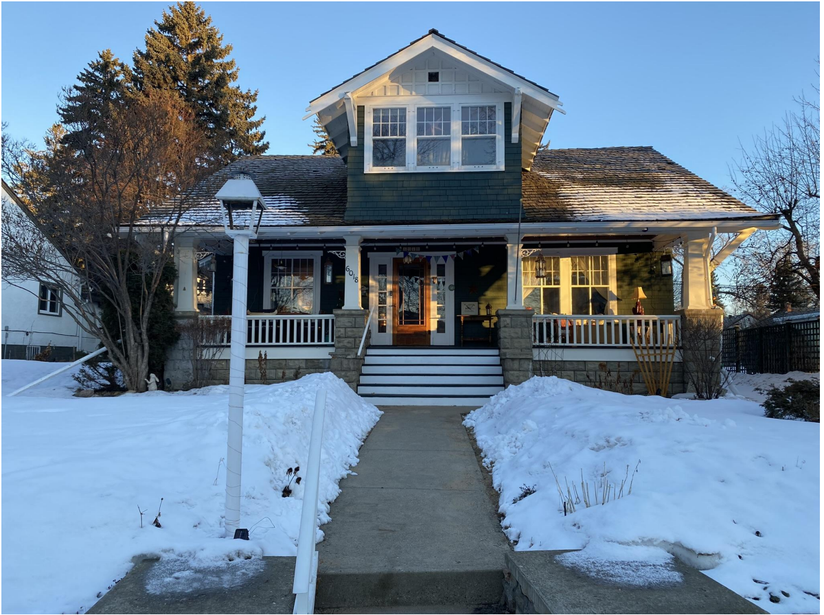
South (front) elevation, looking north from 111 Avenue NW.