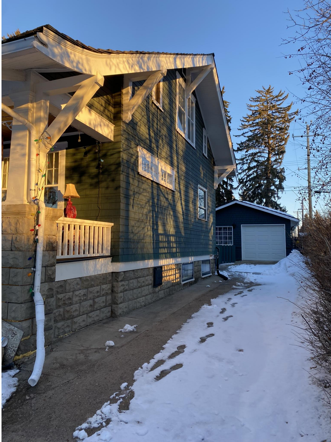
East elevation, looking northwest.