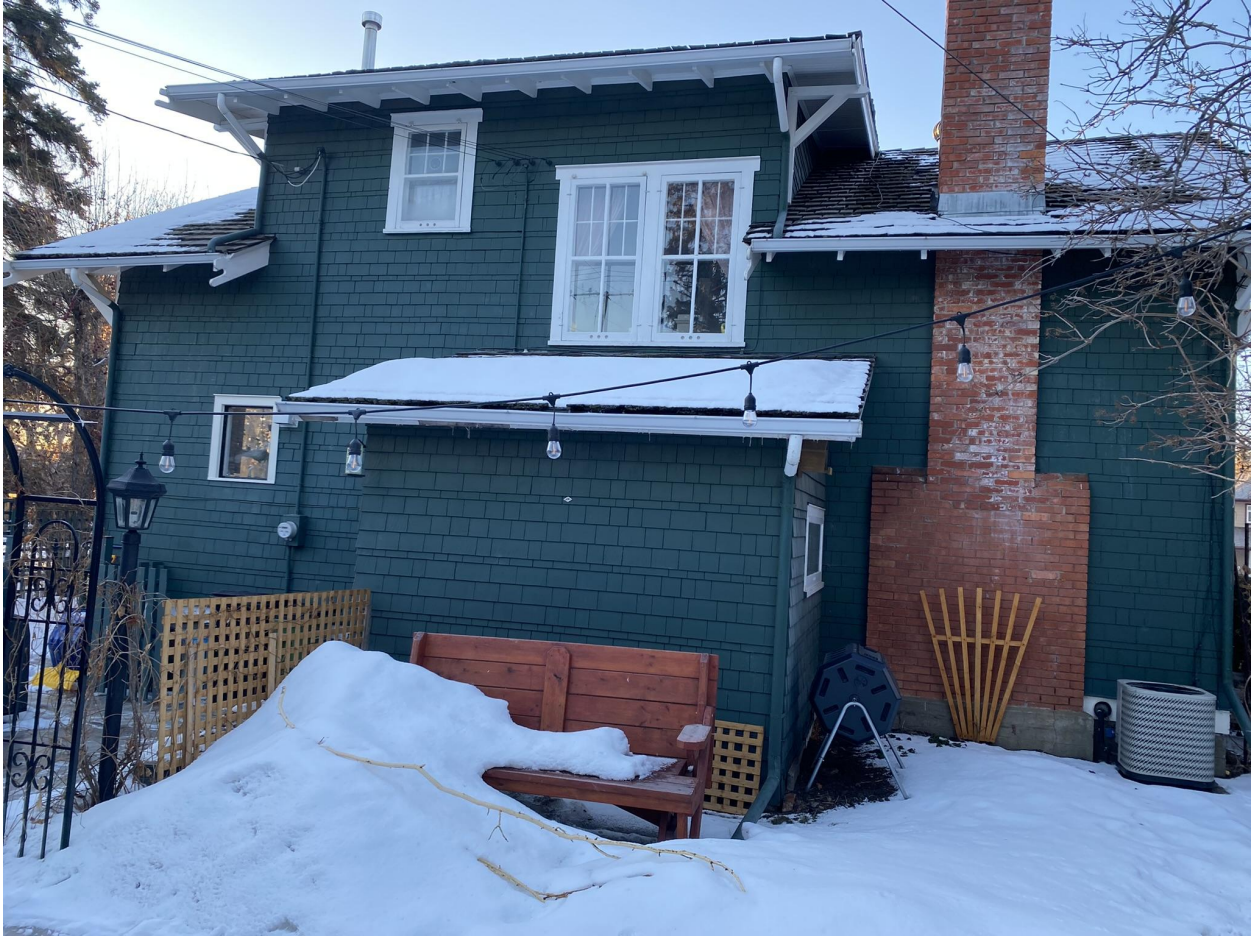
North (rear) elevation, looking south from property rear yard.