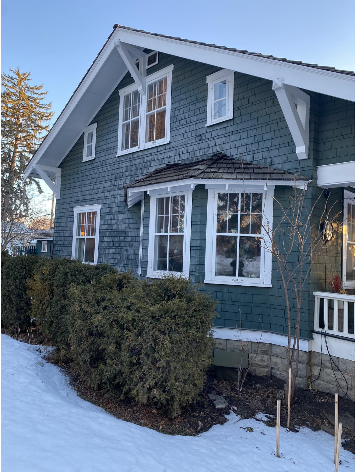
West elevation, looking northeast.