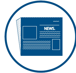
JOURNAL AD August 12, 2022