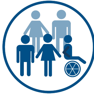
PRE-APPLICATION April 13, 2022