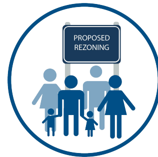
SITE SIGNAGE April 22, 2022