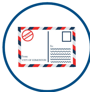
PUBLIC HEARING NOTICE August 18, 2022