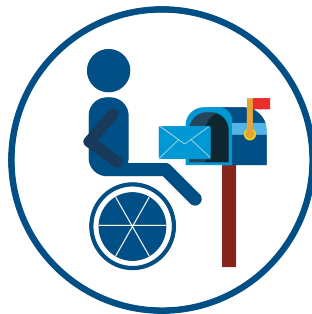
ADVANCE NOTICE April 21, 2022