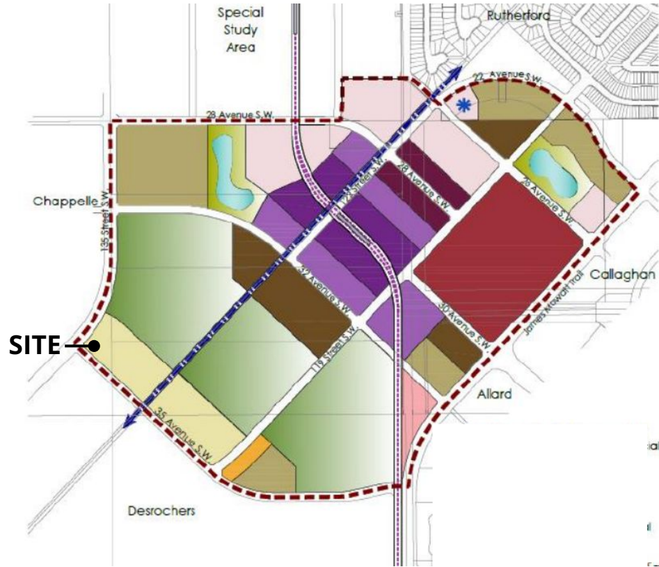
HERITAGE VALLEY TOWN CENTRE NASP