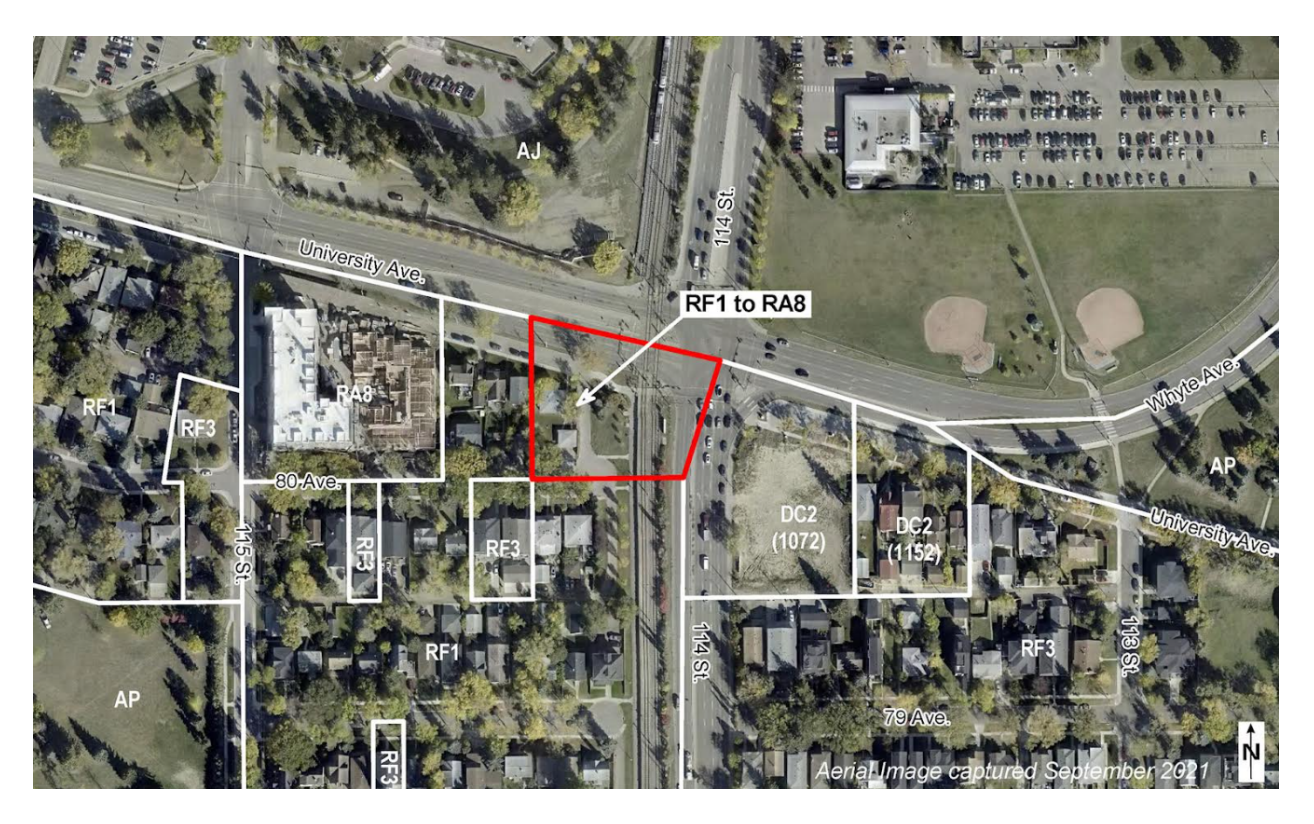
Aerial view of application area