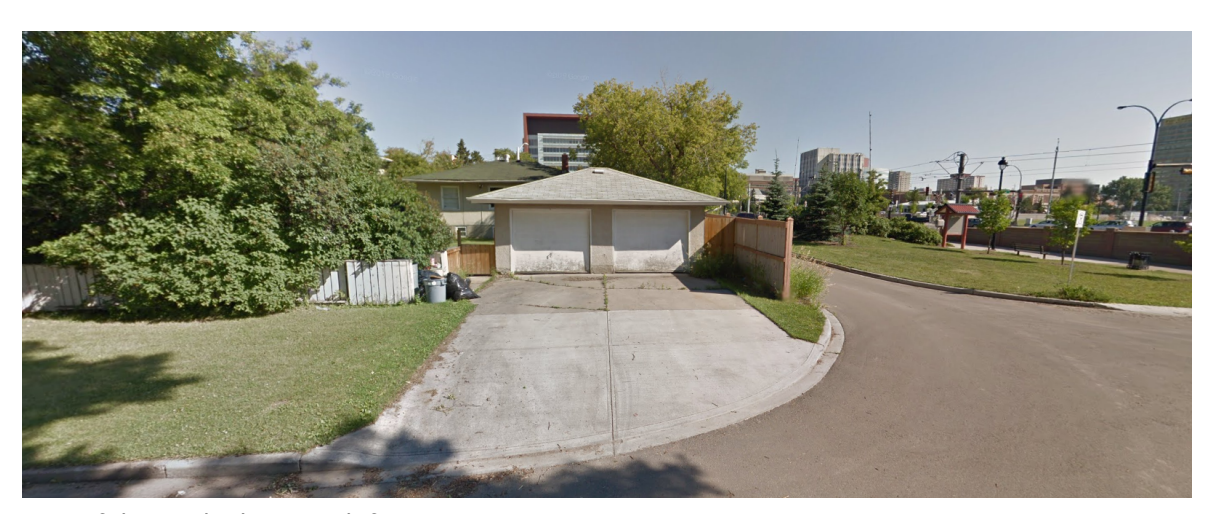
View of the site looking north from 80 Avenue NW