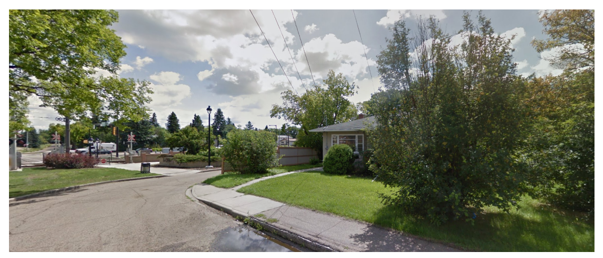
View of the site looking southeast from University Avenue (service road)