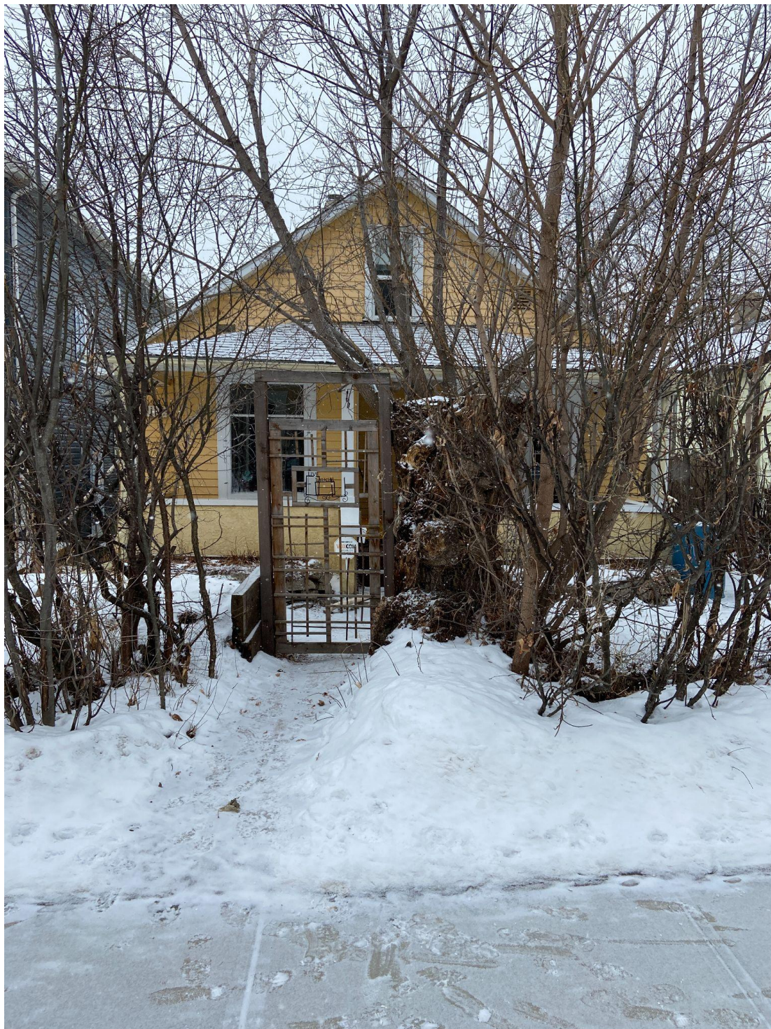
North (front) elevation, looking south from 84 Avenue NW.