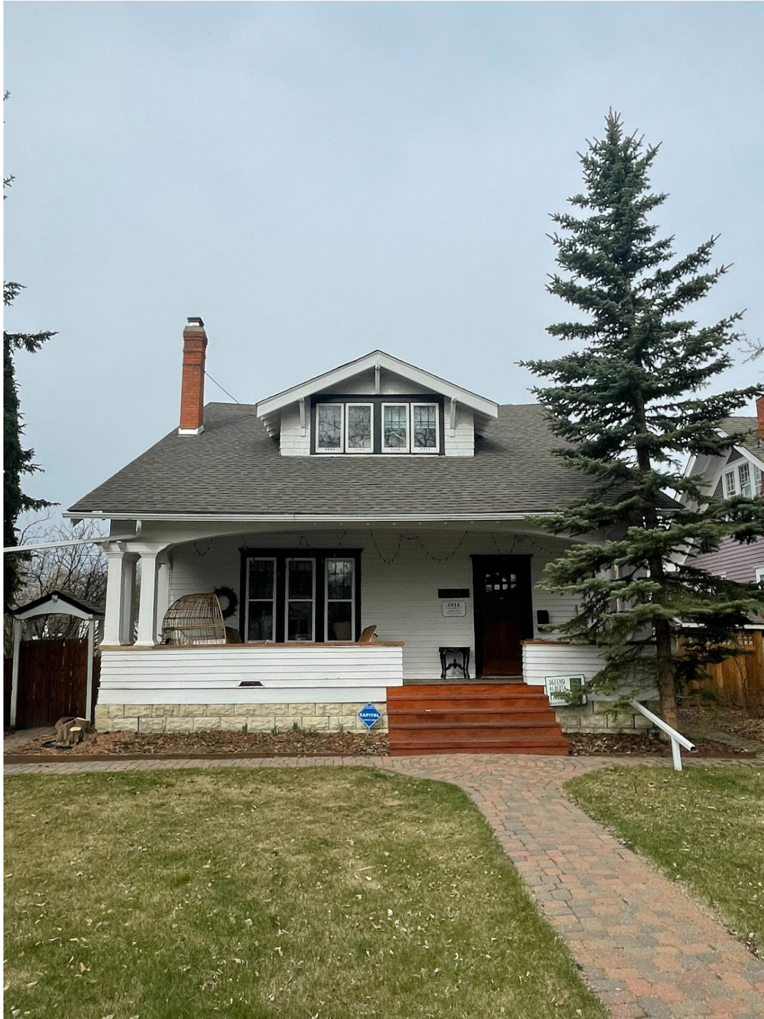
East (front) elevation, looking west from 125 Street.