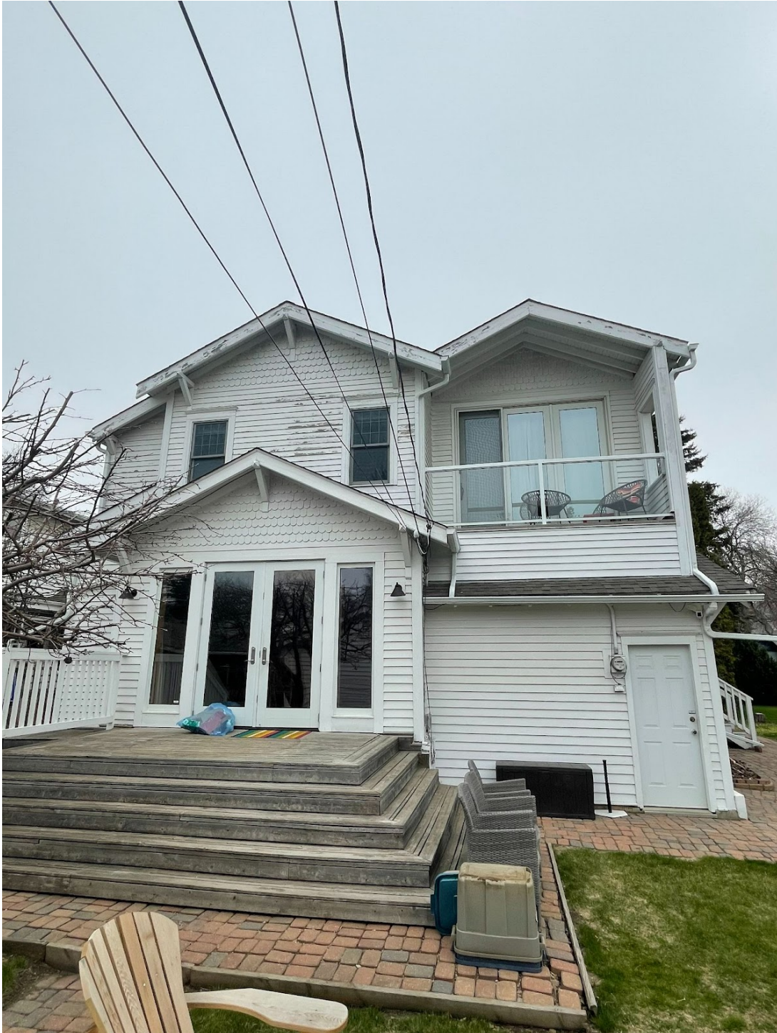
West elevation, looking east (west elevation is not subject to designation, provided for context).