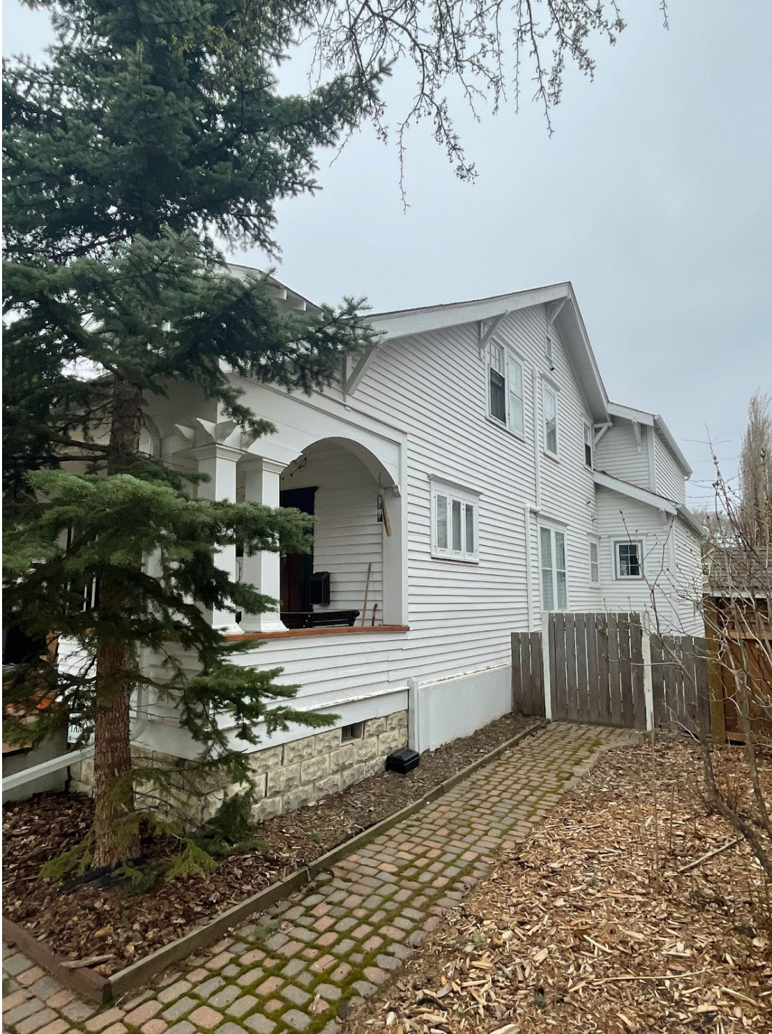
North elevation, looking southwest.