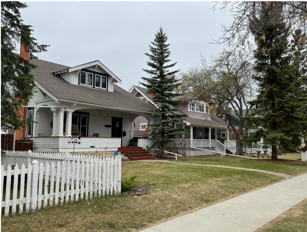
Context photo with Joseph Stein Residence in foreground, looking northwest.