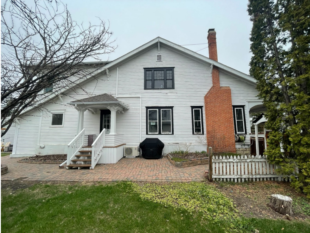
South elevation, looking north.