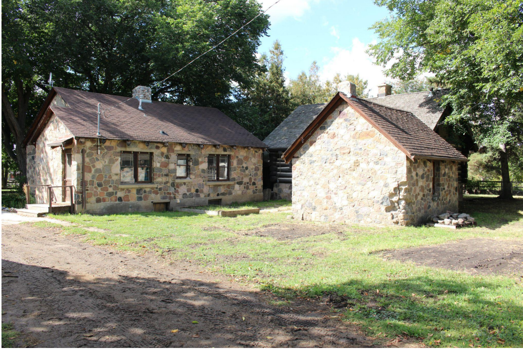
Stone House (at left of photo) and Summer Kitchen (at right of photo), with Keillor Cabin in background