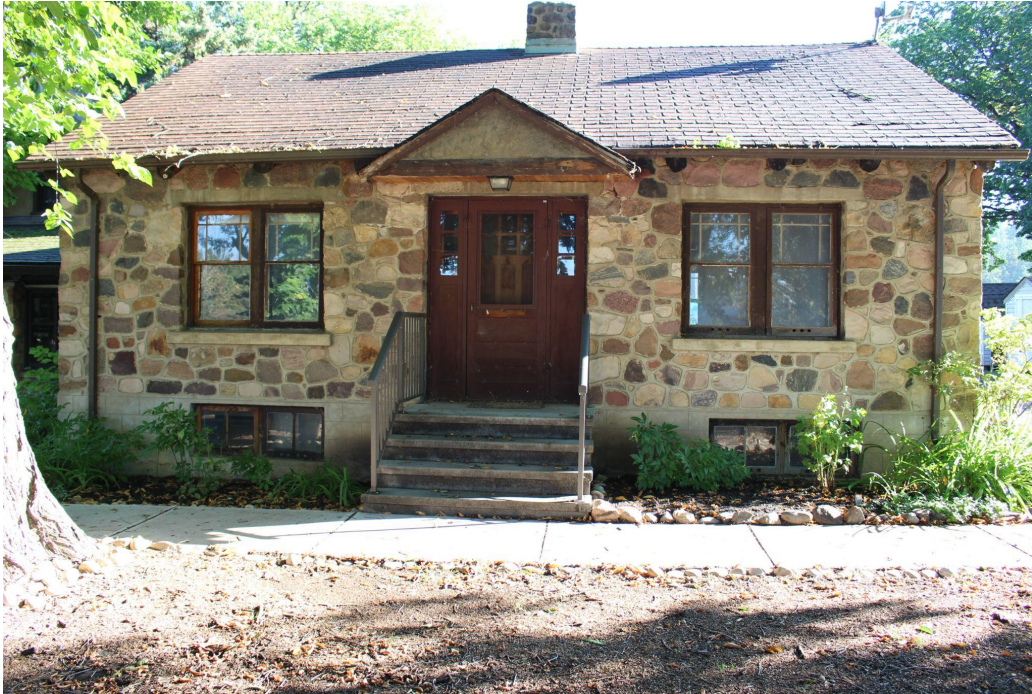
Stone House west (front) elevation