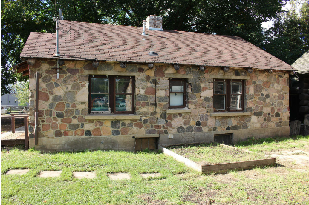
Stone House east elevation